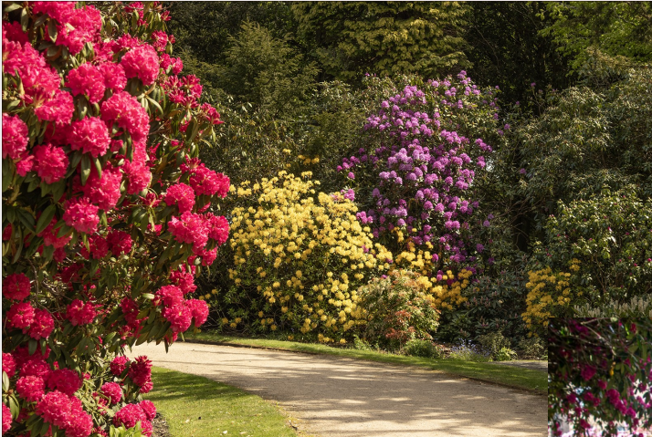
The Formal Garden