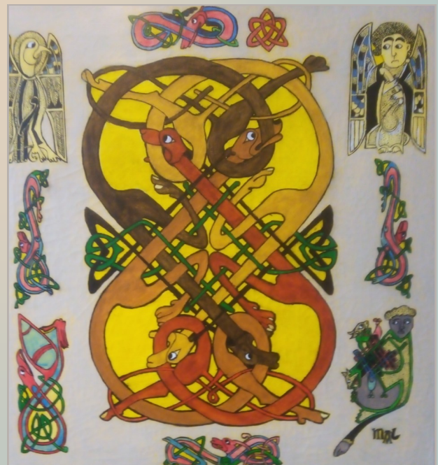
Celtic Boar - Malcolm Lamond