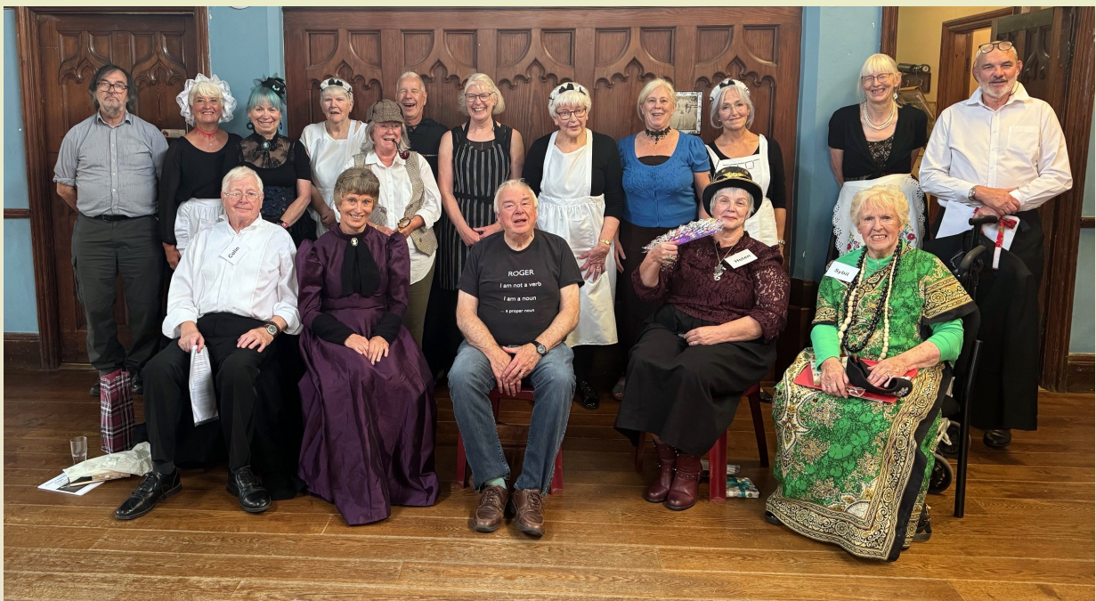
Cast and 'Crew'

Then, it was on to the main event. The actors took to the stage.