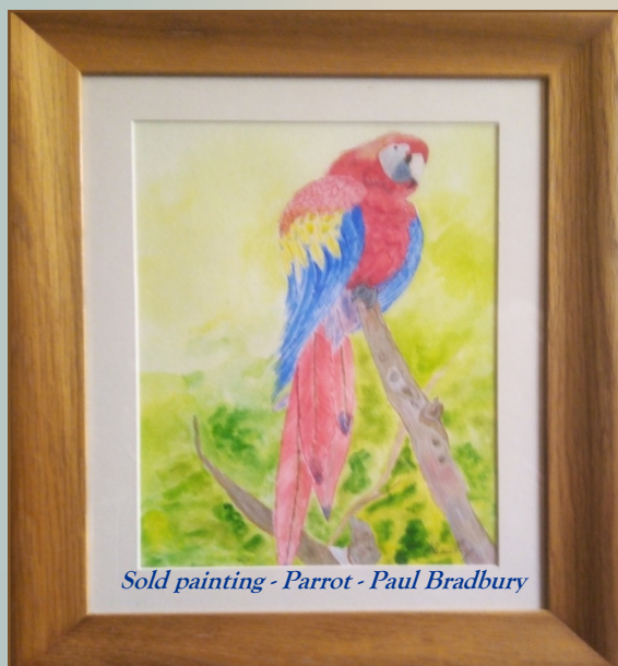
Sold painting - Parrot - Paul Bradbury