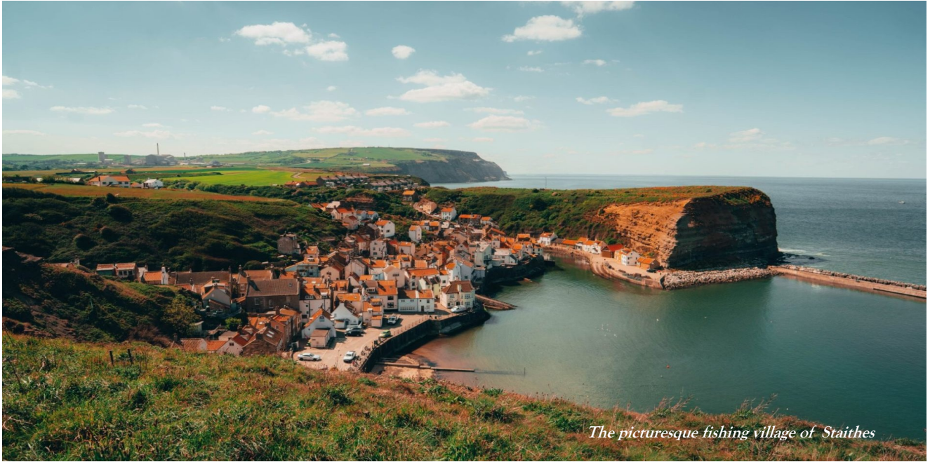
The picturesque fishing village of Staithes

Website: https://saltburndistrict.u3asite.uk/