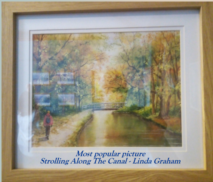
Most popular picture Strolling Along The Canal - Linda Graham