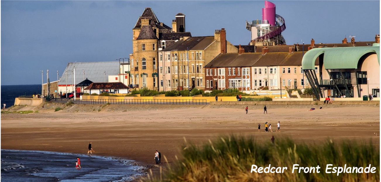
Redcar Front Esplanade

Website: https://saltburndistrict.u3asite.uk/